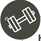
Table 1: Internal Strengths and Challenges