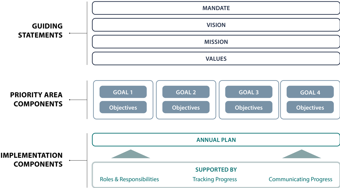
■ Figure 5: Strategic Plan Framework .....

(priority areas). To help realize the priorities and vision of an organization, strategic plans also outline the roles and resources needed to implement the plan and track progress (implementation components). This Strategic Plan was grounded in the framework outlined in Figure 2. The associated definitions can be found in Table 3.