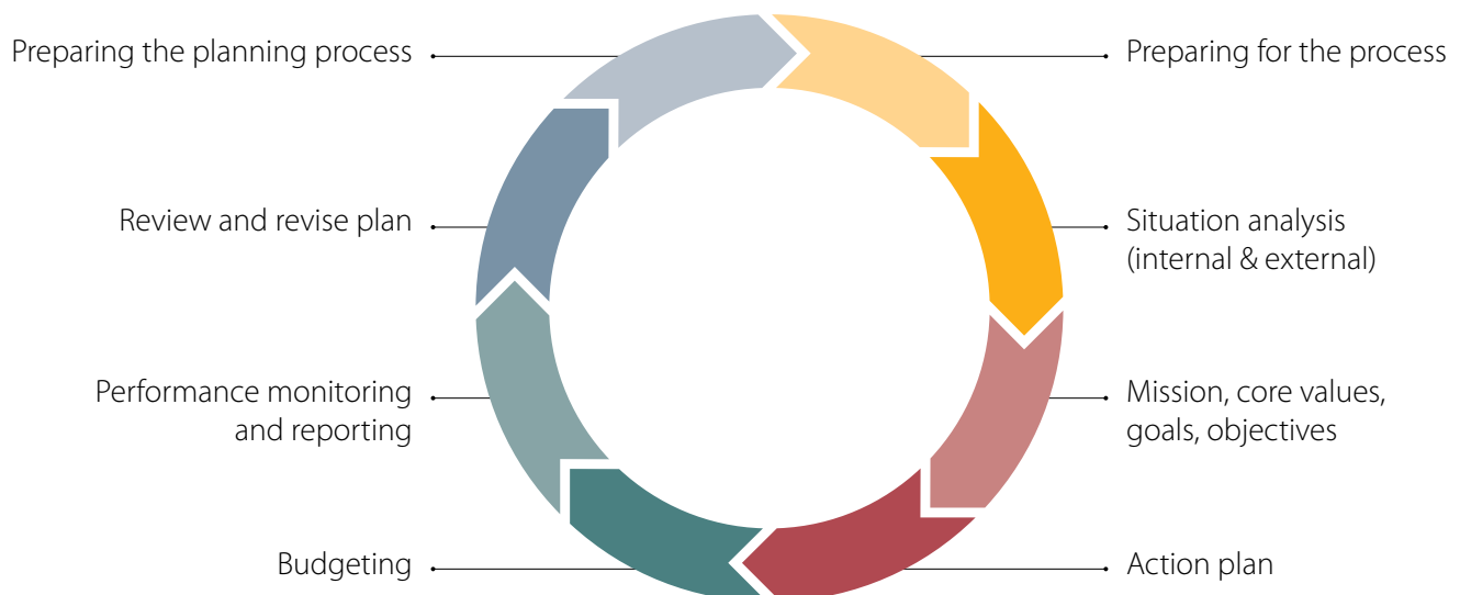
■ Figure 1: Typical Strategic Planning Process

For more information about strategic planning, including a common framework and definitions of key components, see Appendix D.