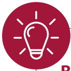
Table 2: External Opportunities and Threats